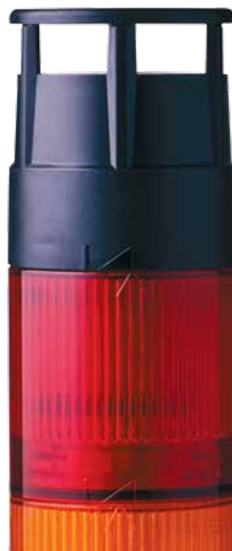
CT5ZM Top Piezo Summer module